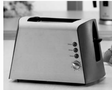
MODEL: RHBT-015 RUSSELL HOBBS 2 SLICE TOASTER